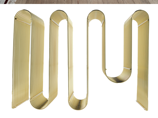
MAGAZINE HOLDER, AYTM AT MYTHERESA