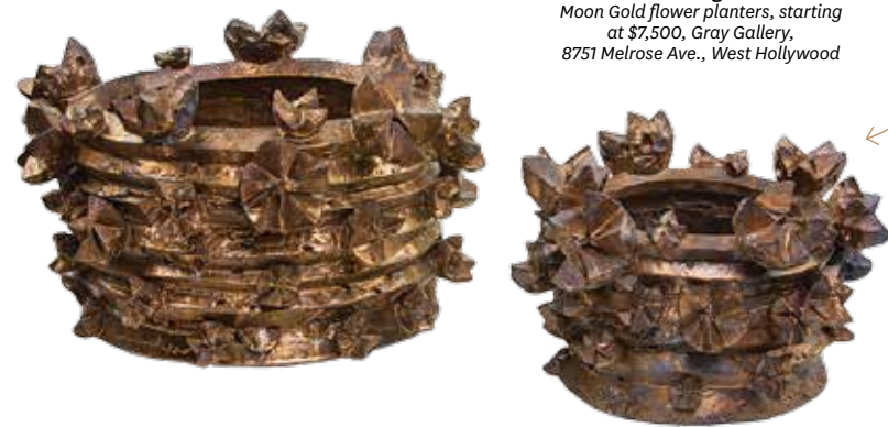
Jay Jeffers "The texture and color of these planters are stunning — almost as if they were in bloom themselves. I would fill them with succulents and put them on the dining-room table." Moon Gold flower planters, starting at $7,500, Gray Gallery, 8751 Melrose Ave., West Hollywood