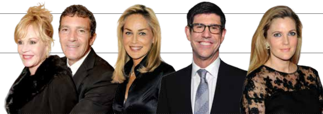
From left: Griffth, Banderas, Stone, Ross and Barrymore