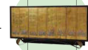
Jean de Merry's Cassetto cabinet (8417 Melrose Place), $25,050; The Haas Brothers' Brass Stool, $12,000, r20thcentury.com